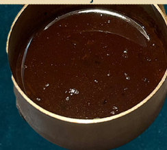
Louisiana Cajun Sauce