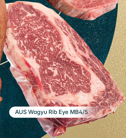
AUS Wagyu Rib Eye MB4/5