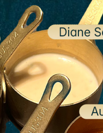
Au Jus Sauce